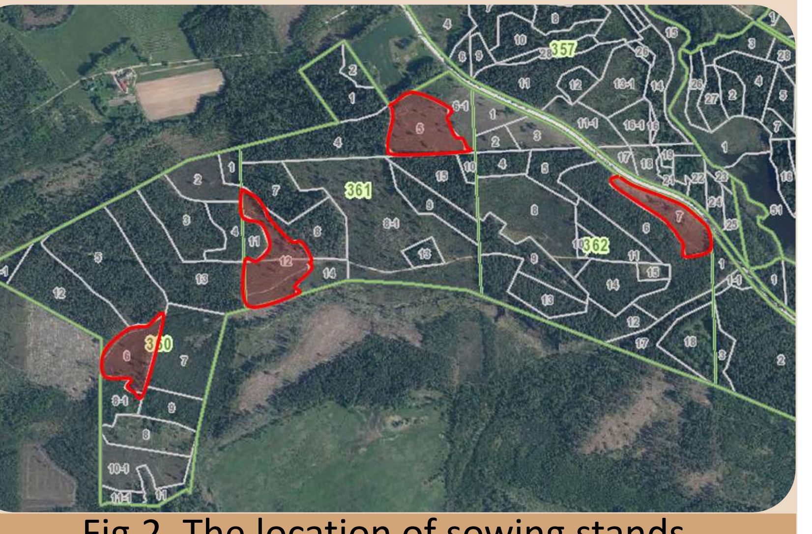
Fig.2. The location of sowing stands in East Vidzeme, Ergeme region