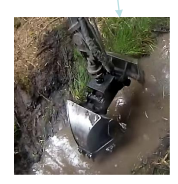
Small ditch building